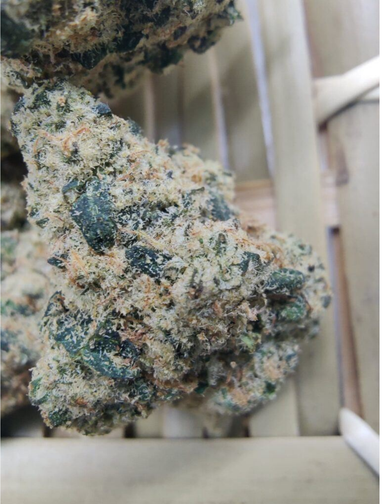
Figure 1: A large, irregularly shaped, green and brownish-yellow mass, likely a biological specimen such as a mold or fungus, resting on a light-colored surface.