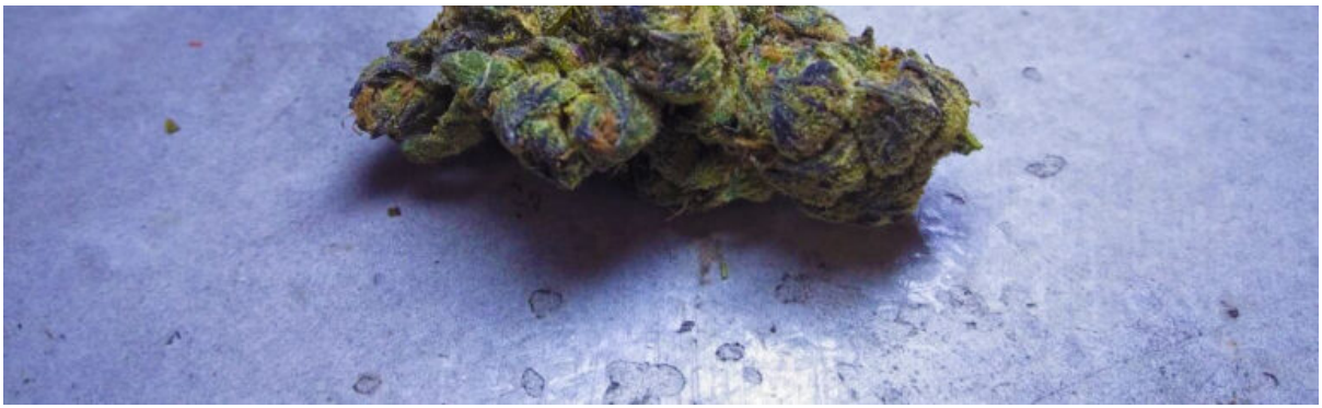
( https://www.patong-cannabis.com/patong-dispensary/ )