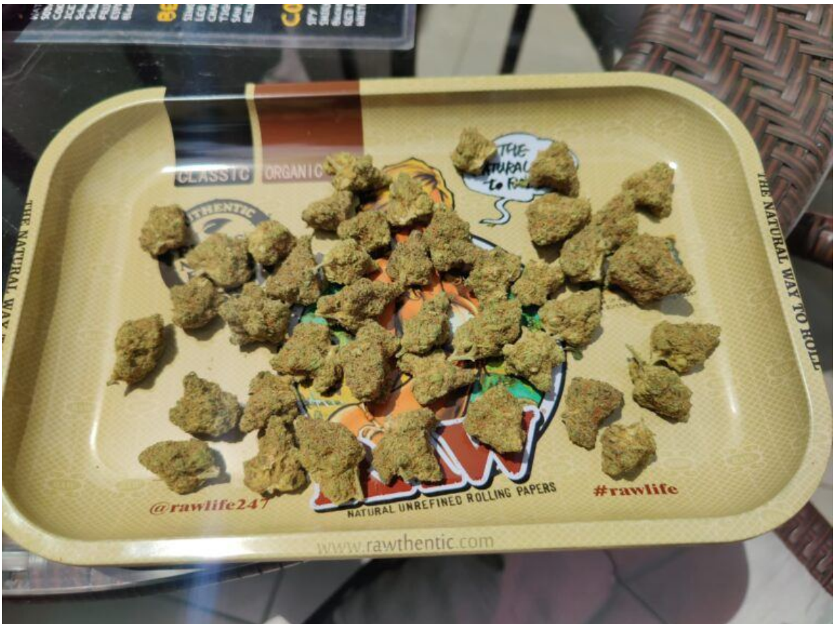
( https://www.patong-cannabis.com/patong-dispensary/ )