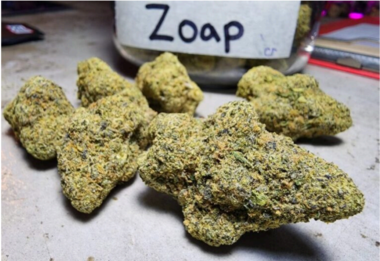
( https://www.patong-cannabis.com/ )